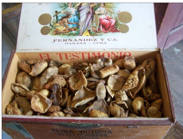
Pangolin scales, featured in one of the Mai Wah Museum's blog posts.